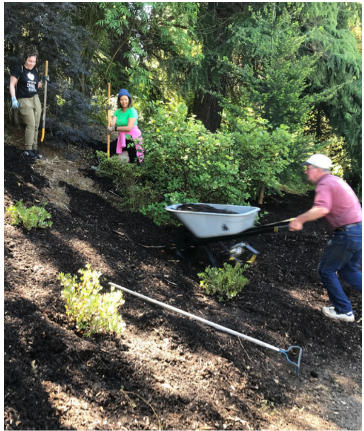
Volunteers mulch new plantings of Manzanita on the sunny west side of Laurelhurst Park.